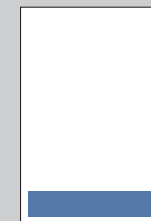
1/8 Page 5" x 1"