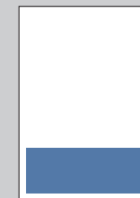
1/4 Page 5" x 2"