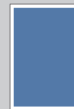
Full Page 5" x 8"