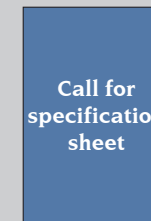
Tip-in reply card