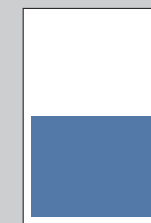
1/2 Page 5" x 4"